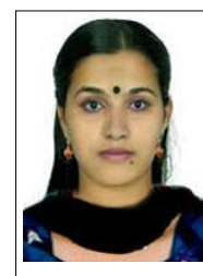
Acceptable format of Sample Photograph

If the face in the photograph is not clear, your application is liable to be rejected.