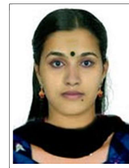
Acceptable format of Sample Photograph

If the face in the photograph is not clear, your application is liable to be rejected.